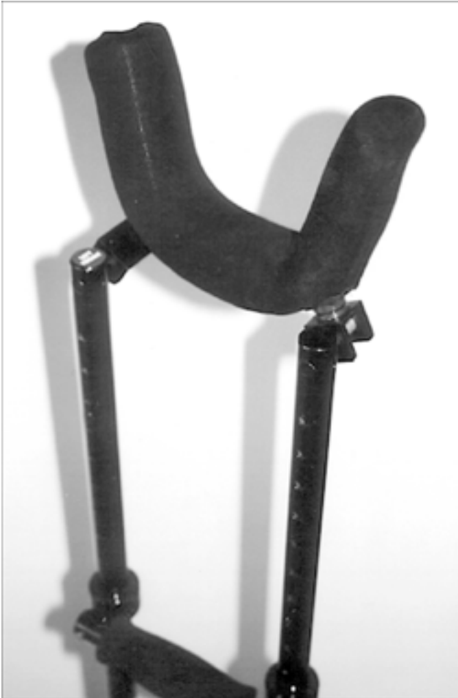
Figure 2. Easy Strutter™ device axillary support.

expenditure index (EEI) has been shown to provide an effective \text{VO}_2 estimate during continuous, submaximal activity [3,23–26]. Rose et al. [23,24] defined the EEI as