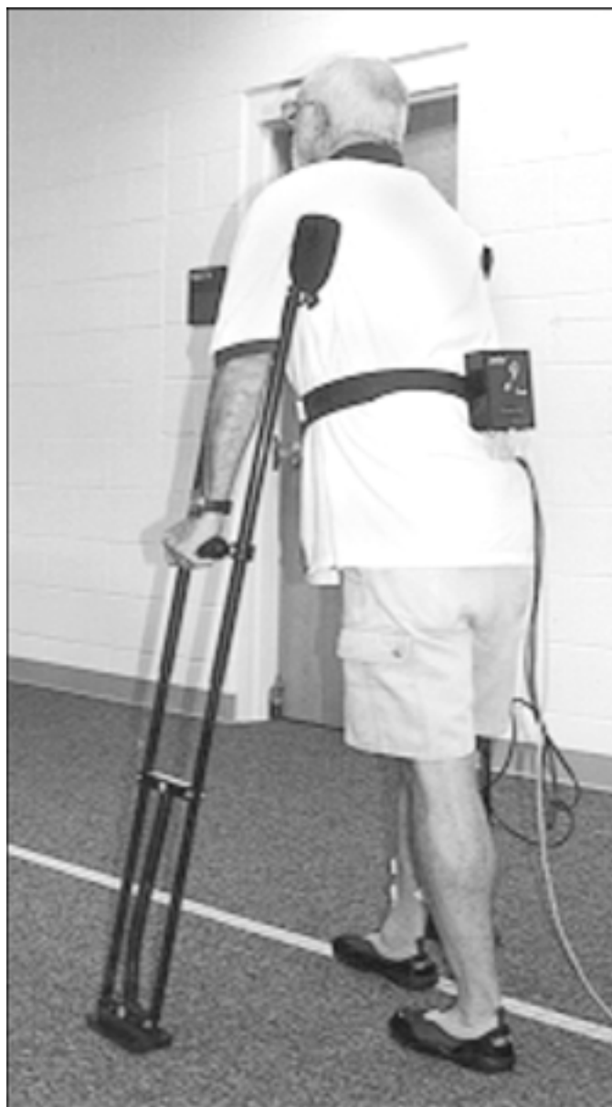
Figure 1. Easy Strutter Functional Orthosis System™.

All gaits that use assistive devices are less energy efficient than nonimpaired ambulation [4]. In comparing the energy costs of 3-point axillary or elbow crutch ambulation to normal walking on multiple surfaces among eight nonimpaired subjects, Fisher and Patterson reported almost doubled oxygen uptake (VO 2 ) requirements with either assistive device [15]. In a related study, Patterson and Fisher reported that crutch walking with a 3-point