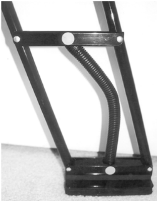
Figure 4. Easy Strutter™ device base or “foot.”

step depth, 76.2 cm step width, 76.2 cm × 76.2 cm landing dimensions, four steps) over the entire 15.24 m gait course. The flat surface was covered with wall-to-wall indoor/outdoor carpet, and the hardwood stair steps had an antislip finish. The carpeted surface did not appear to influence subject gait characteristics, although the nonslip nature of the gait course may not have adequately represented performance on a low-friction tiled or wet floor environment [32]. During axillary crutch use, subjects were instructed to use their upper limbs for support and to avoid excessive axillary loading. During ESFOS use, subjects were instructed to bear weight completely through the axillary pads, as recommended by the manufacturer [30]. Subjects were asked to assume a self-directed, comfortable pace, a modified 3-point gait pattern (50% unilateral weight bearing on the involved side, as discussed in the next section) and a “heel-to-toe” progression. Subjects wore a gait belt during practice and data collection