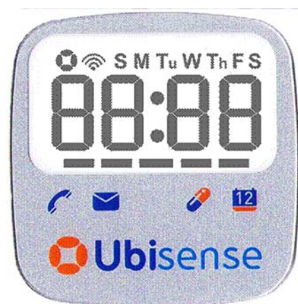
Figure 2. Ubiwatch display with example overlay. Ubiwatch ordinarily displays digital display of time and day of week. Programmable display can show four-character strings such as PILL or APPT as needed. Soft buttons activated by pressing display face adjust lighting display, etc.

While a four-element, seven-segment display cannot represent all possible letters, it can still provide four-character informative messages such as PILL, APPT, CALL, HELP, bAtt, PANL, etc. The LCD display unit has a novel backlight driven by multiple RGB LEDs that allows the entire display to illuminate in many different colors. This can be used to tailor the contrast of the